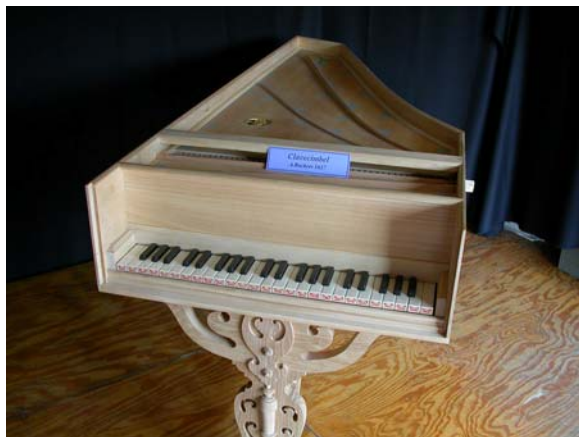
Original size 2272 x 1704 pixels

Just to give you two examples I entered “Bus” and “Keys” in the search box and chose these two images, both high resolution and with a full size as shown below the image: