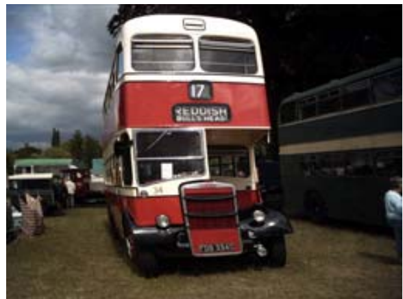
Original Size 1024 x 768 pixels

That is the free segment of this newsletter, here is a new program that isn't free.